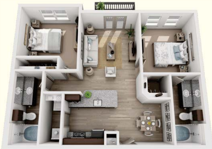
B1 2 Bedroom / 2 Bath 955 Sq. Ft.*

4520 Gus Thomasson Road Mesquite, TX 75150 (972) 686-2661