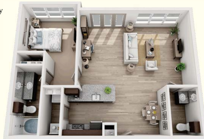
B1- LW 1 Live/Work/ 1.5 Bath 955 Sq. Ft.*

*Approximate Square Footage Only. Renderings are an artist's conception and are intended only as a general reference. Features, materials, finishes, and layout of subject units may be different than shows.