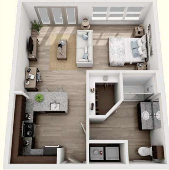
A1- LW 1 Bedroom / 1 Bath 672 Sq. Ft.*