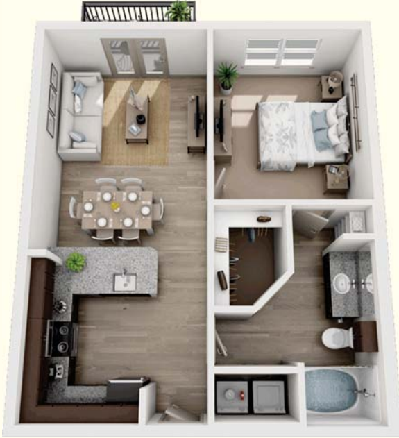
A1 1 Bedroom / 1 Bath 672 Sq. Ft.*